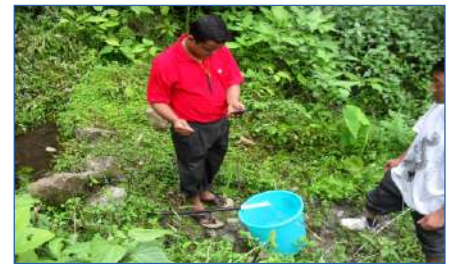
Measurement of Spring Discharge