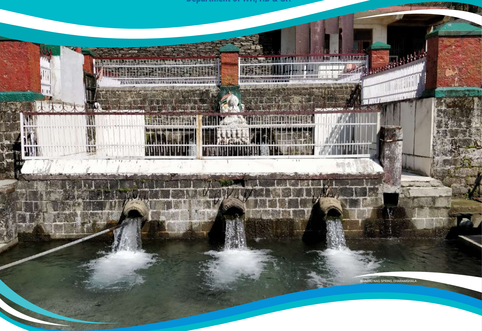
BHAGSU NAG SPRING, DHARAMSHALA

Government of India Ministry of Jal Shakti Department of WR, RD & GR