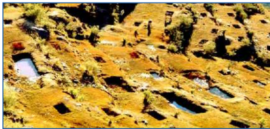
Staggered Contour Trenches