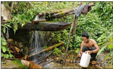
Spring Water Collection